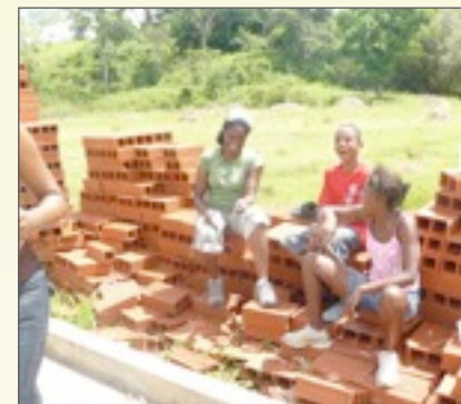
Volunteering with Habitat for Humanity 2008